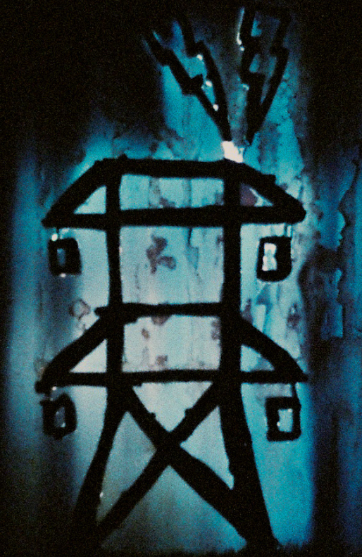
Riding on the counterweight