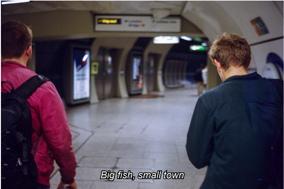
Big fish, small town