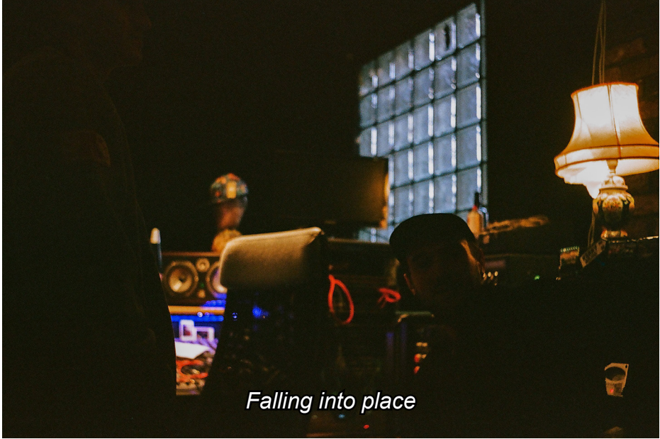
Falling into place