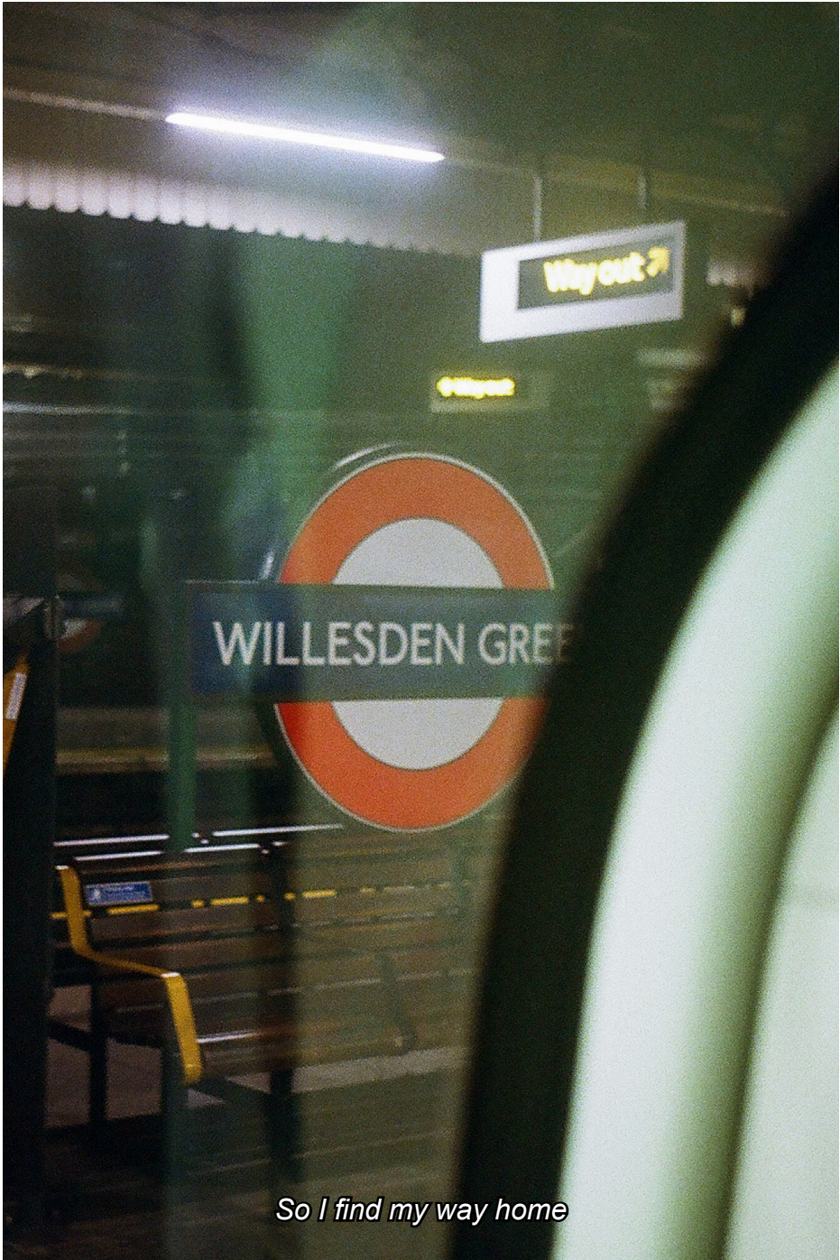
So I find my way home