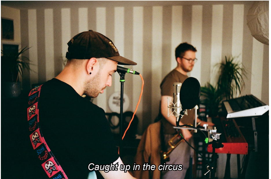
Caught up in the circus