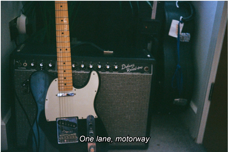
One lane, motorway