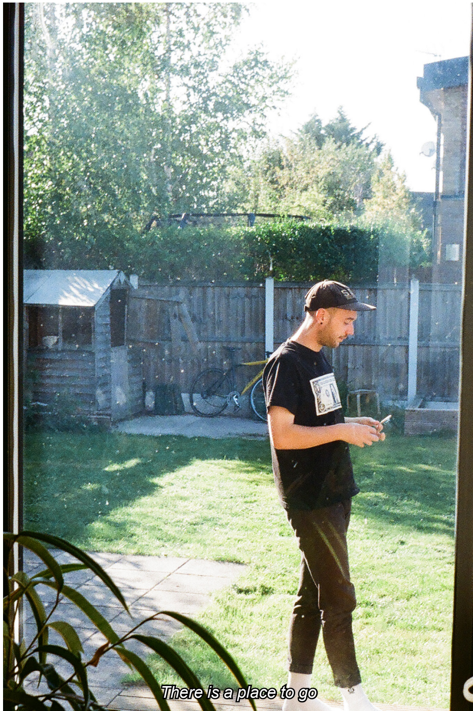
There is a place to go