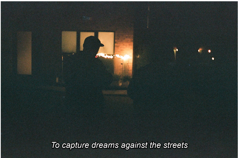
To capture dreams against the streets